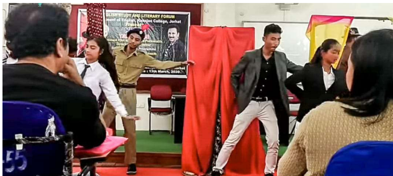
STUDENT PERFORMING DRAMA