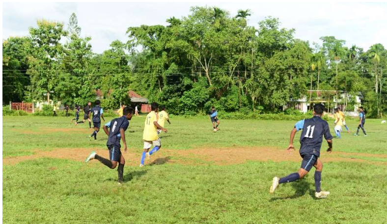
UTILIZATION OF PAYGROUND DURING INTERCOLLEGE FOOTBALL TOURNAMENT

4.1.2 - The Institution has adequate facilities for cultural activities, sports, games (indoor, outdoor), gymnasium, yoga centre etc.