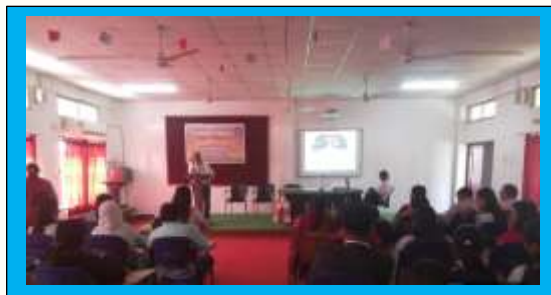
Activity of NSS Unit