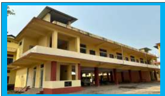
RUSA Building under 2.0 Scheme