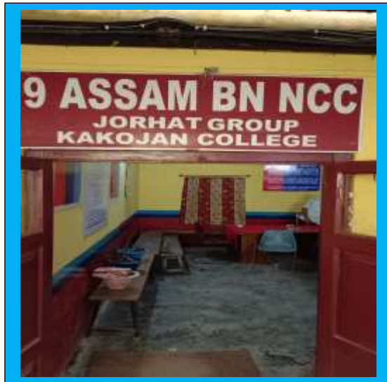
NCC Unit under 9 Assam BN NCC